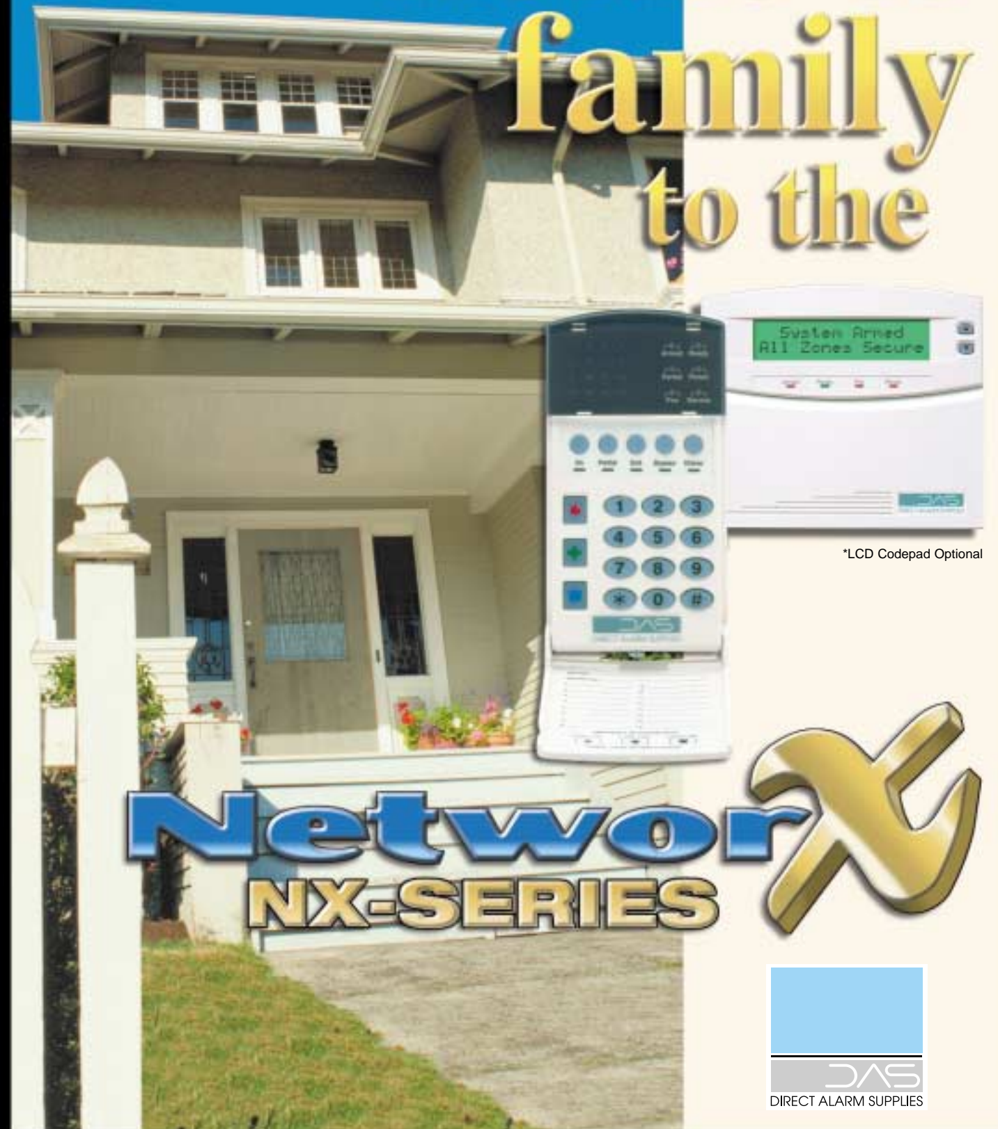
*LCD Codepad Optional