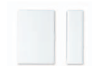
Ultra-Small Wireless Door Contact (MG-DCT2) Range: 18m (60ft)*

* typical range in a residential environment