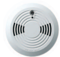
EVERday Wireless Smoke Detector (SD738) Compatible with Magellan Range: 30m (100ft)*