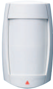
Digital Wireless Motion Detector with Pet Immunity (MG-PMD75) Range: 35m (115ft)*