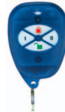
Remote Control (MG-REM1) Range: 30m (100ft)*