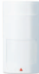
Wireless Motion Detector (MG-PMD1) Range: 35m (115ft)*