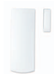
Wireless Door Contact (MG-DCT1) Range: 35m (115ft)*